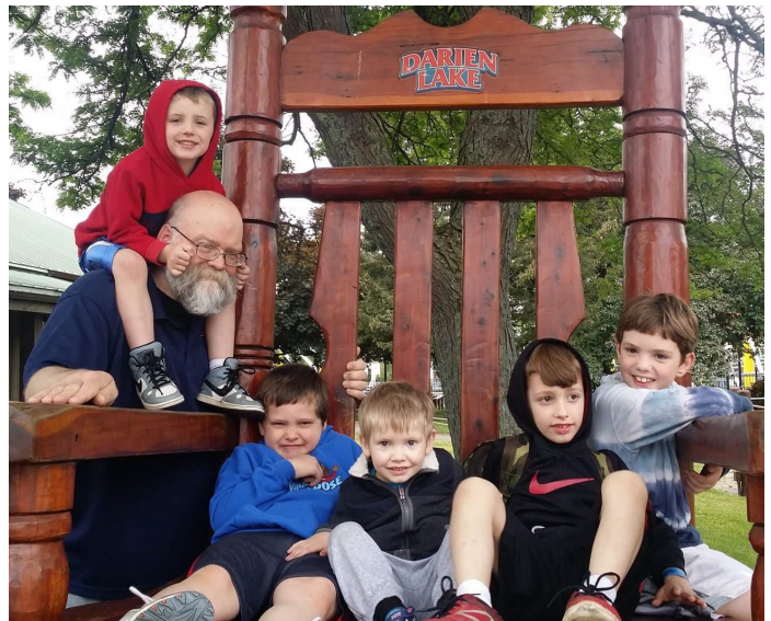
Moose Weekend @ Darien Lake