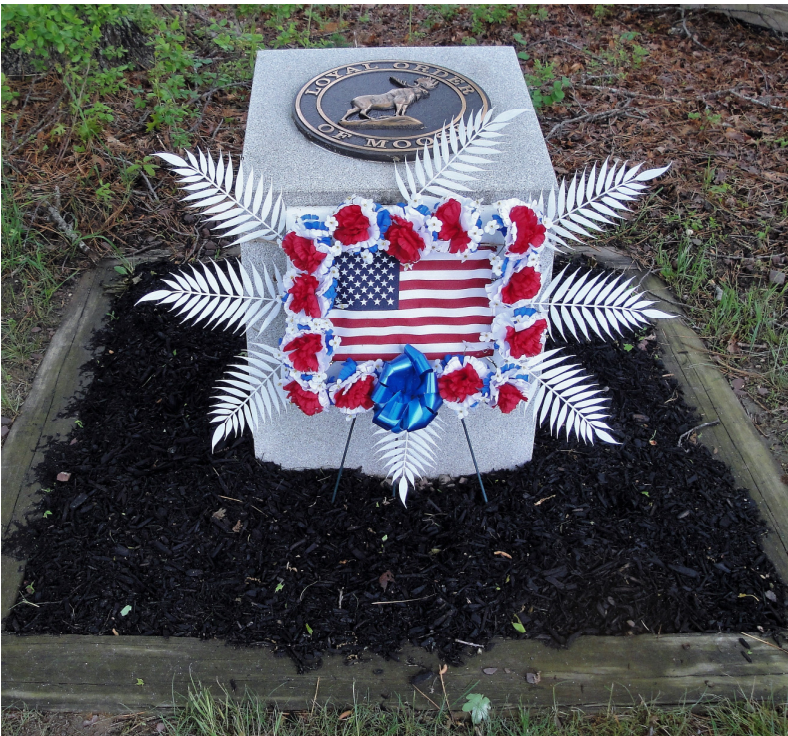
Photo is of Loyal Order of Moose Monument at Calverton National Cemetery. District #4 is, again, on the Support Committee of the Cemetery. Funds were donated by Port Jefferson Lodge #1379 in the name of District #4 and other Lodge Brothers attended the latest support committee meeting.

The objectives of the Association are to bring together in closer fraternal cooperation the lodges and chapters of the Loyal Order of Moose and the membership of such lodges and chapters in the State of New York; to aid and promote the purposes of the Loyal Order of Moose; to build the membership strength of the Order; to exchange ideas and ideals which may be of benefit to the various lodges and their members; to promote interest in the work of Ritual Staffs and similar units; to encourage a broader interest in sports and family activities; to stimulate participation in Community Service programs; to adopt programs and projects for the betterment of Mooseheart and Moosehaven to include the building of the Endowment Fund for the support of these institutions; to foster closer relationship between lodges and chapters in New York and lodges and chapters in neighboring state / provinces, and to co-ordinate the programs and directives of Moose International, Inc. and the Supreme Lodge.