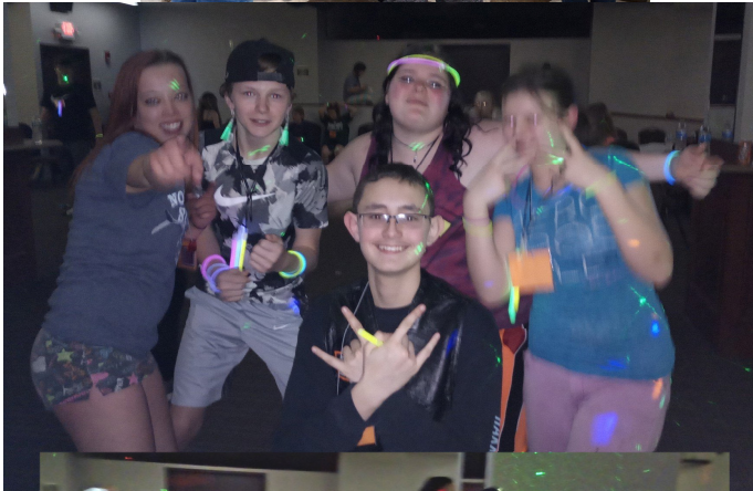
Teen Club/ Youth Group @ Binghamton, NY 2018